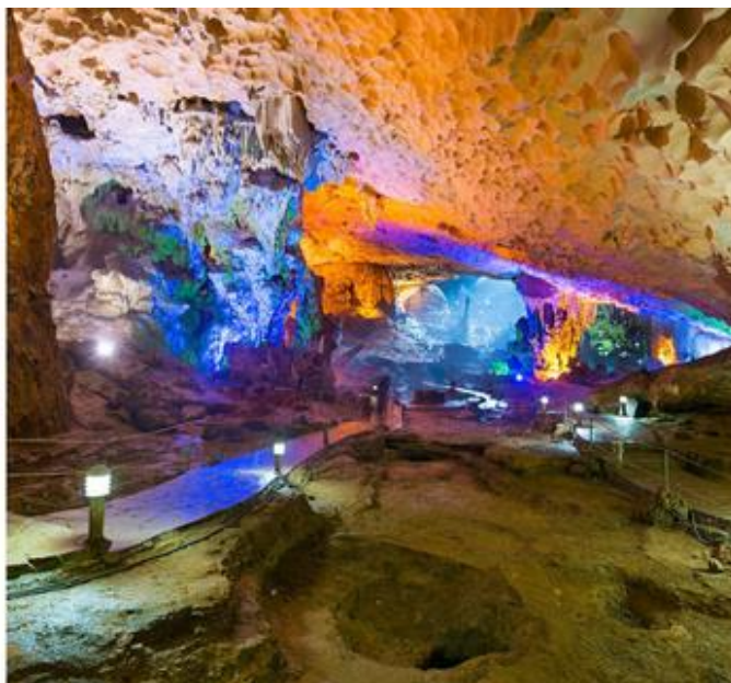
Thien Cung Cave

At 15:00 PM, we finish our boat trip and back to our vehicle for transferring to Hanoi.