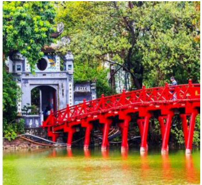
Hoan Kiem Lake and Ngoc Son Temple