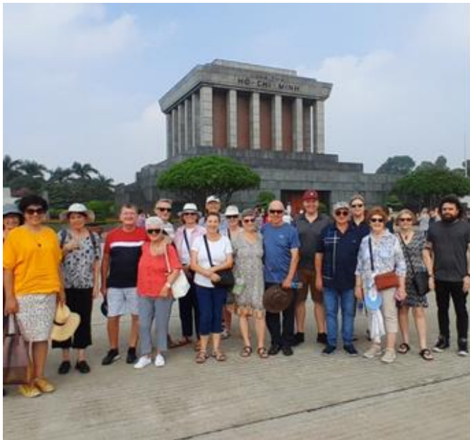
Ho Chi Minh Complex

In the afternoon, start your half day city. Your first stop will be the Ho Chi Minh Complex , where the father of modern-day Vietnam declared the nation’s independence in 1945. Discover the reverence with which the Vietnamese treat their “Uncle Ho” at this pilgrimage site. Continue your tour at sites such as the Stilt House, Presidential Palace, and One Pillar Pagoda. Then drive to the Temple of Literature , built in honor of Confucius by Emperor Ly Thanh Tong in 1070. Visit the Temple of Literature , Vietnam's first university, for a touch of history. Then visit Hoan Kiem Lake (Sword Lake) and Ngoc Son Temple with Sunrise Bridge.